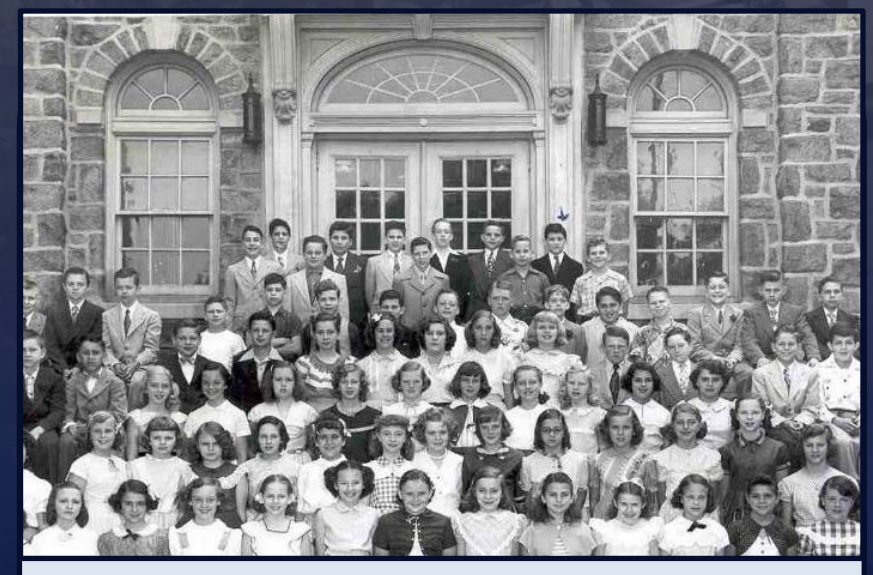
Historic image of Brookline School entry façade depicting the arch motif.