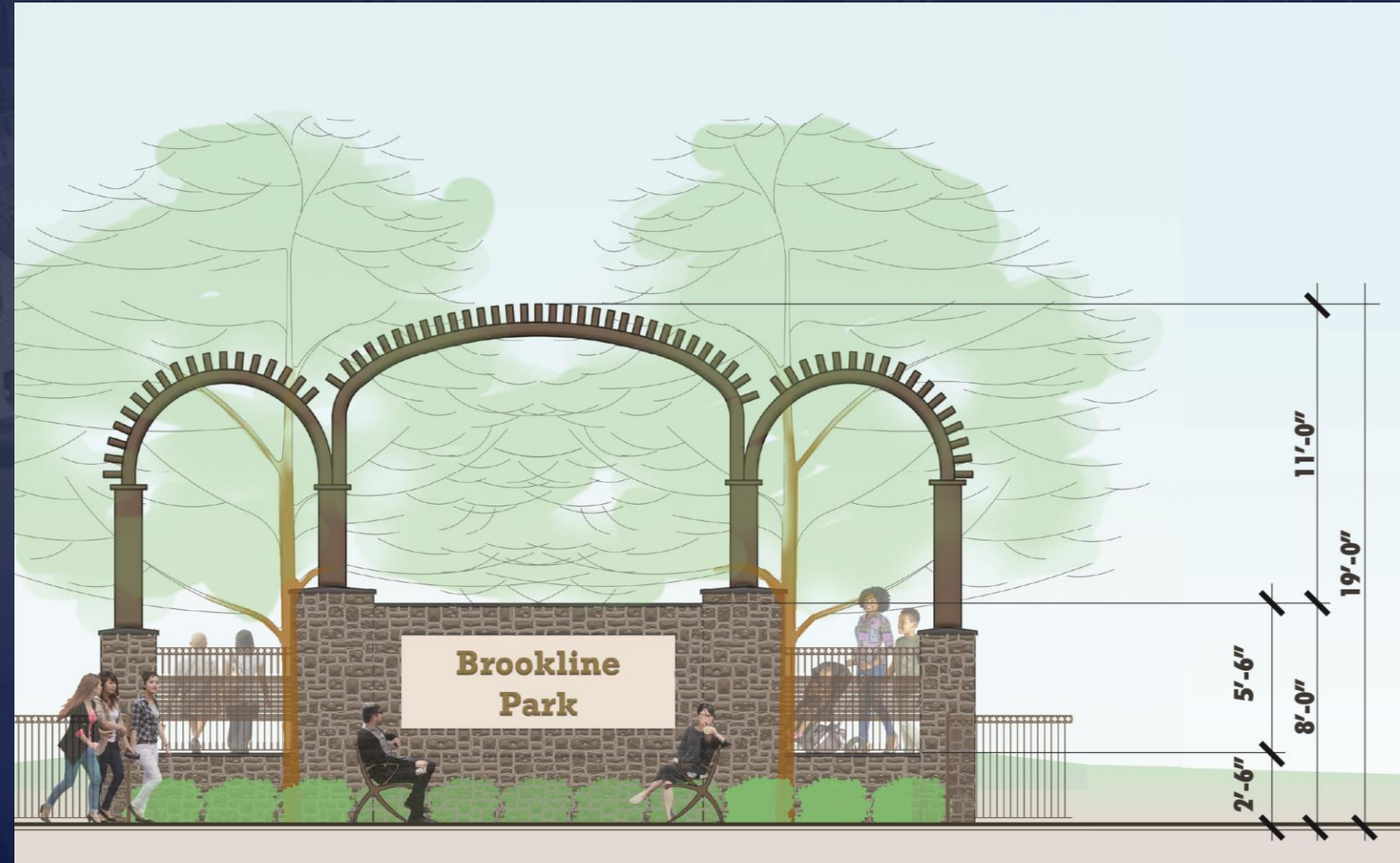
Elevation of Feature Wall viewed from Earlington Road